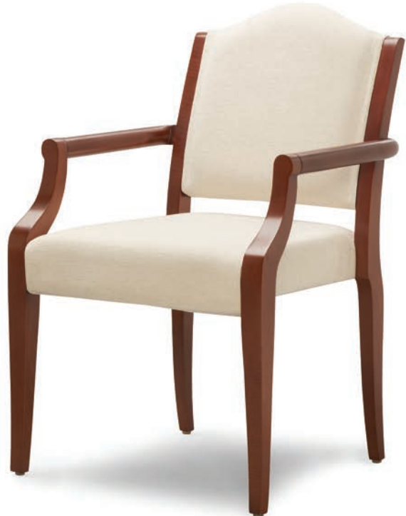
552 Stacking Arm Chair Exposed Wood Arm / Open Back W 23" D 25" H 35" SH 19" AH 25"