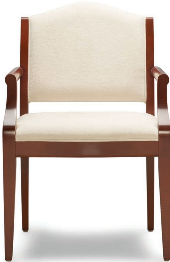
577 Open Arm Side Chair Exposed Wood Top Arm W 23" D 25" H 35" SH 19" AH 25"