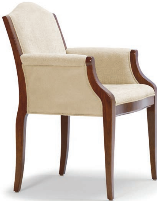
560 Closed Arm Side Chair Upholstered Top Arm / Closed Back W 23" D 25" H 35" SH 19" AH 25"