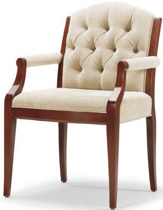
571 Open Arm Side Chair Upholstered Top Arm / Tufted Back W 23" D 25" H 35" SH 19" AH 25"