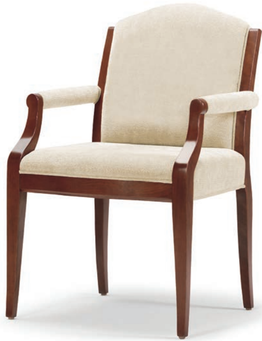
570 Open Arm Side Chair Upholstered Top Arm / Closed Back W 23" D 25" H 35" SH 19" AH 25"