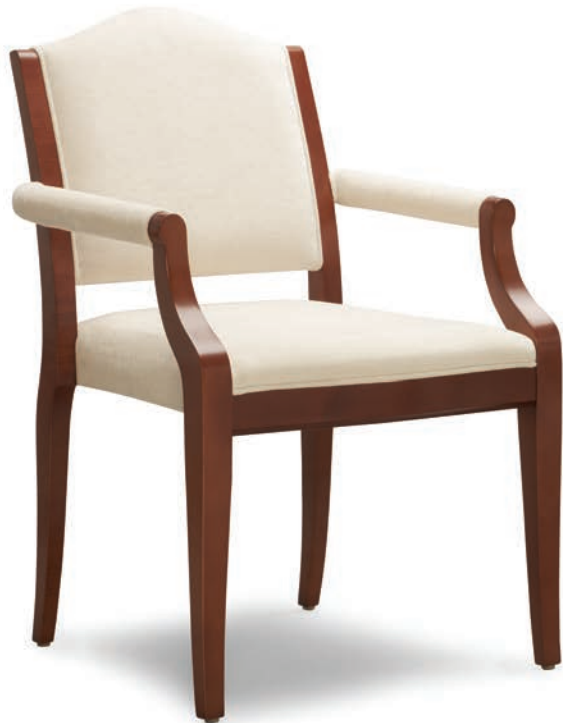
550 Stacking Arm Chair Upholstered Arm / Open Back W 23" D 25" H 35" SH 19" AH 25"

(2) 550 Models In Stacking Position *Chairs may be stacked four high without a dolly. Please contact factory for information regarding additional stacking capacity.